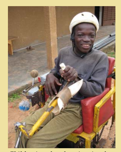
Child using the electric tricycle